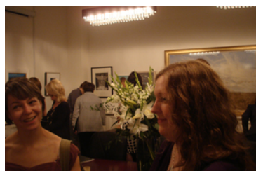
View of the Board Room